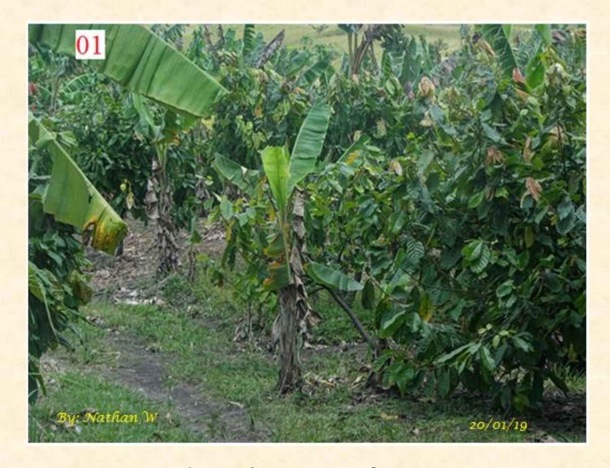
Limited application of Best Management Practise